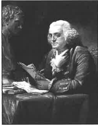
Benjamin Franklin worked on the Articles of Confederation before he helped write the Constitution.